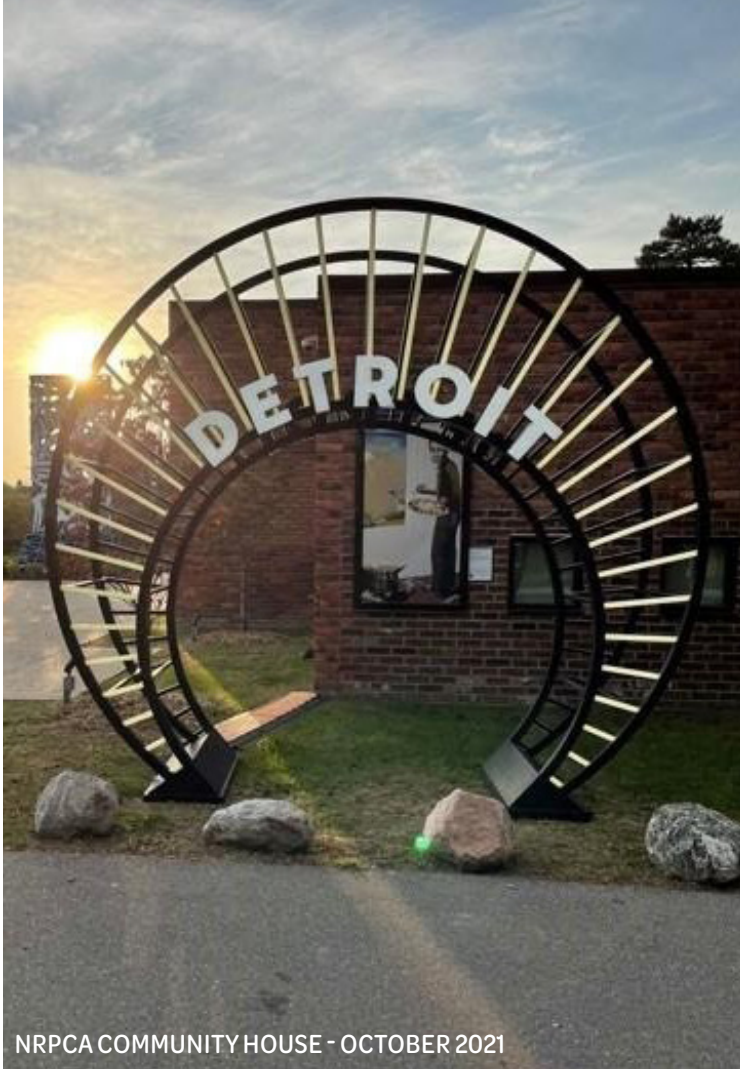
NRPCA COMMUNITY HOUSE - OCTOBER 2021

Michigan begins its fourth pandemic surge in less than 18 months. The pandemic has been a lesson in the price of time. Time to think differently about the paths we are on, the priorities we hold, and the decisions we make. It has also been a lesson for us all about the importance of home and community in our lives. As we approach 2022, the North Rosedale Park Civic Association recognizes that the time is now to build on the strengths that make our community a rare gem among neighborhoods in the City of Detroit.