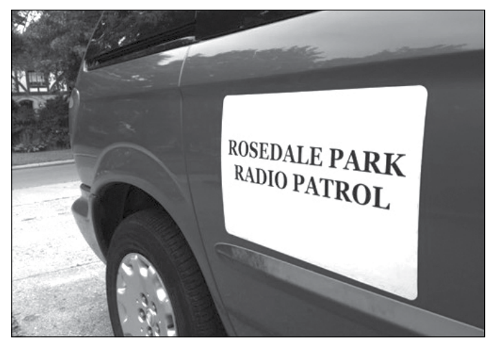
Signing up for the Radio Patrol is easy.

Are you looking for a way to give back to your community? Would you like to get involved in the safety and security of the neighborhood? Would you like to meet more of your neighbors? Then the Rosedale Park Radio Patrol is just what you're looking for! We are an all-volunteer, mobile, community watch made up of active and concerned neighbors. It is one of several neighborhood patrols sanctioned by the City of Detroit and is directly supported by the Detroit Police Department. You can think of the Radio Patrol as the "eyes and ears" of the neighborhood, observing and reporting any suspicious behavior.