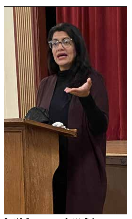
Our U.S. Congressperson, Rashida Tlaib, reports at our meeting.