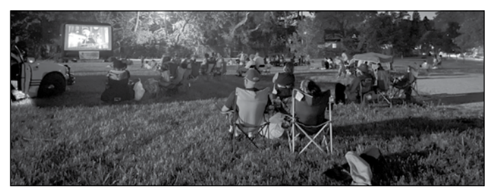
Grandmont Movie Night on May 26.

Looking for a free, family-friendly, outdoor event right in our Rosedale neighborhood? GRDC is hosting this movie series in conjunction with each of the five neighborhoods. RPIA is cohosting our movie night on Saturday, August 14, at Rosemont Acacia Park. The movie begins when it gets dark (after 9 pm).