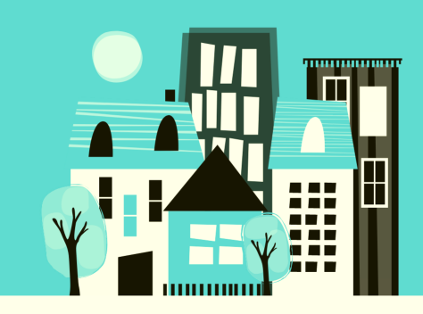
All ages welcome. Bring your rake or shovel and gloves, but tools should be available.

SATURDAY, APRIL 4TH AT 10 AM ON LONGACRE BETWEEN RAY MONNIER &