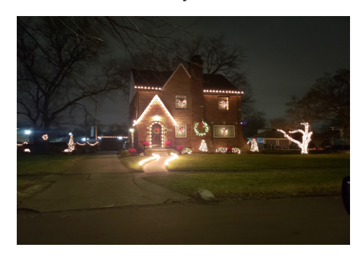
Best Decorated Block Huntington Congratulations and thank you to our winners of the 2018!