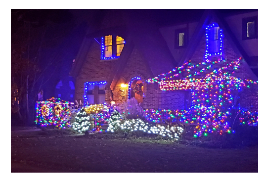
Second Place Gray Family - Shaftsbury