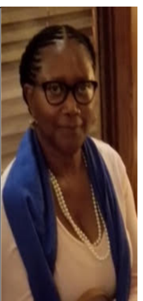
In This Issue