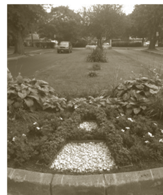
Most Creative award-winner, Artesian between Keeler and Grand River.

All of the winning islands will be honored with prizes and gifts at the annual RPIA banquet in January, so please be sure that a block representative is in attendance.