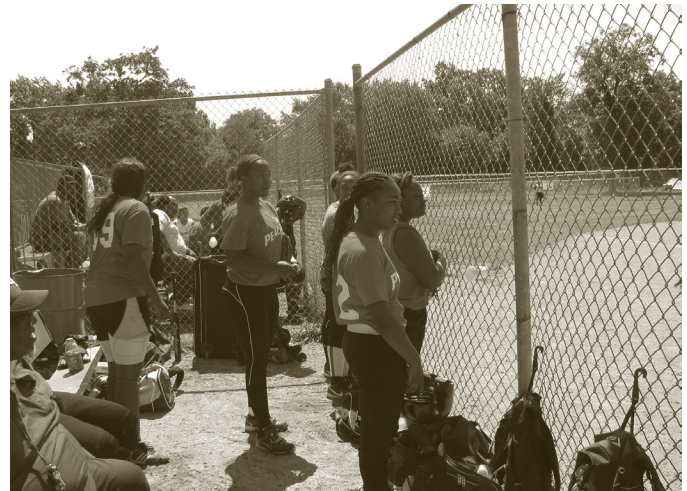
The Rosedale Grandmont Peaches.