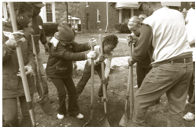
Rosedale Park Girl Scouts and other Rosedale neighbors pitch in at a planting in October 2011.

Don't forget: a good day to plant a tree was 20 years ago! Planting trees is a simple, direct way to invest in our community and to show our faith in the future.