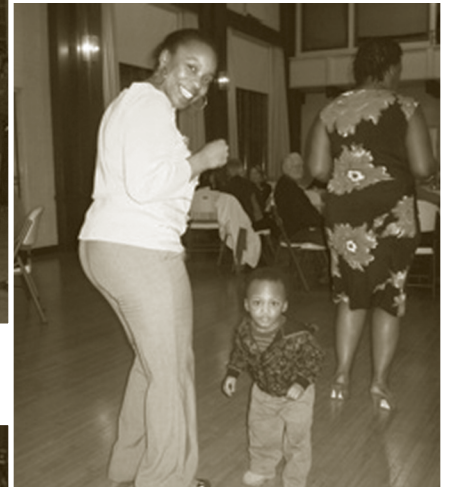
Never too young to start learning the Hustle