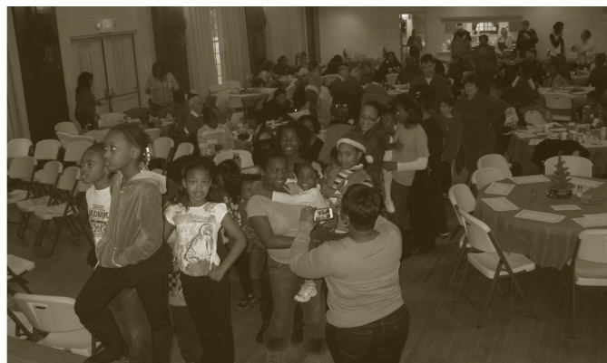
Waiting to visit with Santa.

If you weren't able to attend, make sure to join us next year!