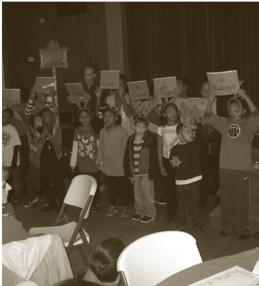
Ever popular -- Rudolph the red nosed reindeer.