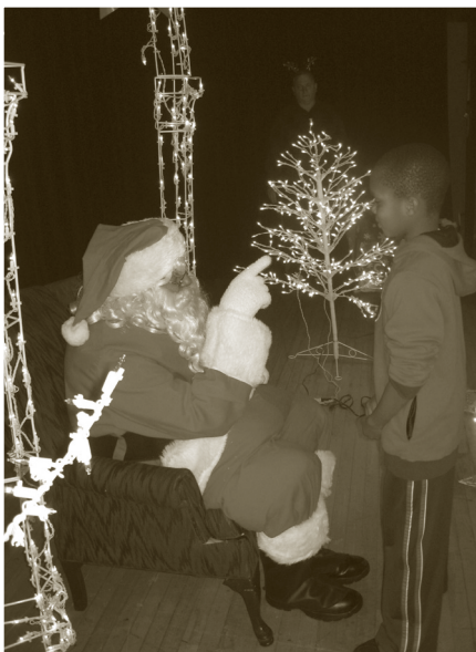
You'd better not pout!