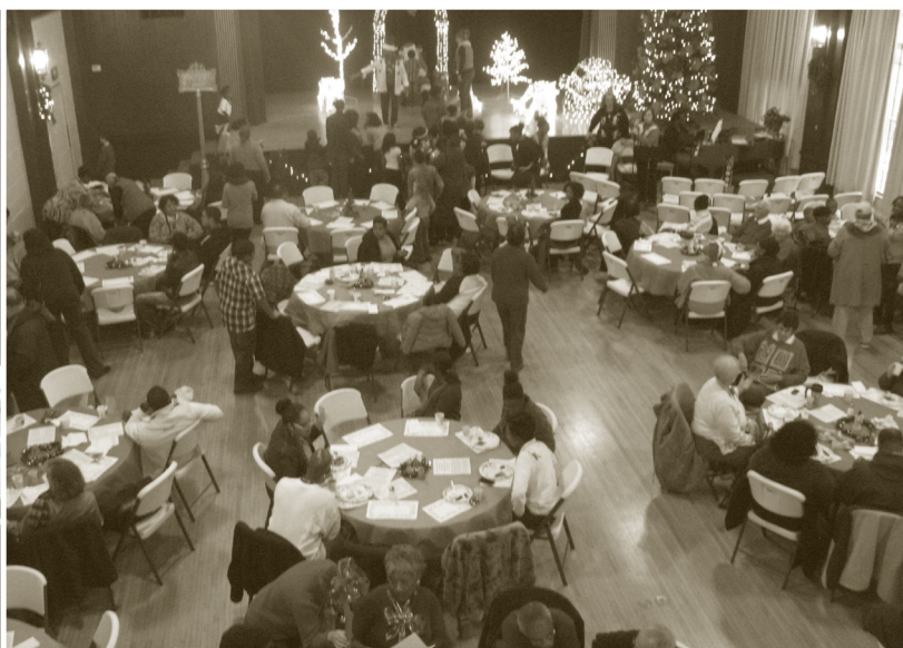
The Community House was festively decorated and bustling with activity!