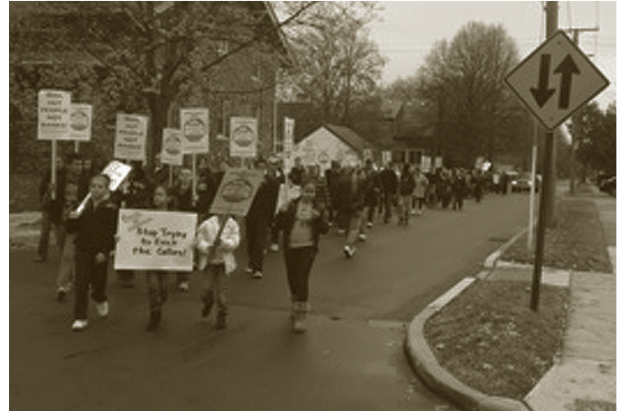
March on Bank of America at Ashton, November 10, 2012.