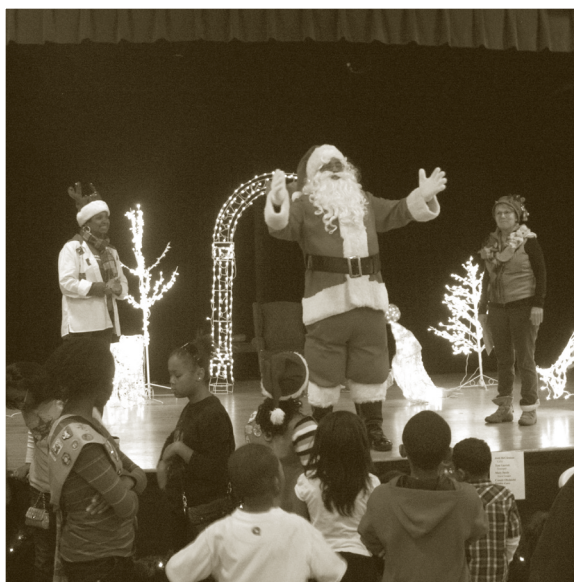
Santa welcoming the boys and girls.