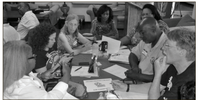
The Abandoned Property/Blight Committee focuses on strategies for a district-wide housing survey.