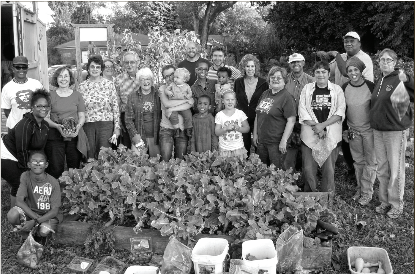
Community gardeners show off some of the bounty.