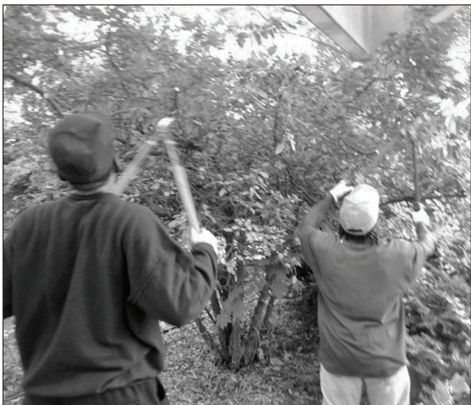
Volunteers with loppers begin to trim bushes.

The project will provide community residents and library patrons with a place of solace, contemplation and refuge within the library campus.