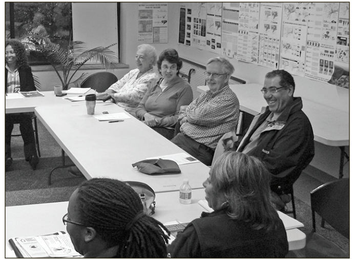
Radio patrol meetings aren't all business, there's a good amount of humor, too.

The next meeting is Tuesday, December 17 at 6:30 PM at the GRDC offices. It's the annual Christmas celebration and potluck.