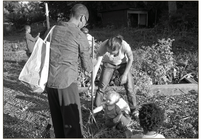
Future gardeners want to help, too.

Volunteers split up the food, which included raspberries, strawberries, peppers, kale, tomatoes, carrots, beets, potatoes, lettuce, broccoli, Swiss chard, onions, garlic, cucumbers, green beans, parsley and a few flowers.