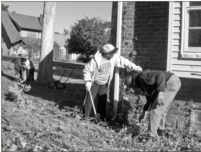
Neighbors tackle some weed trees growing next to the abandoned home.