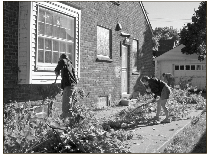
It's looking better already.

1759 21st Street Detroit, MI 48216 313.655.2344 detroitfarmandgarden.com