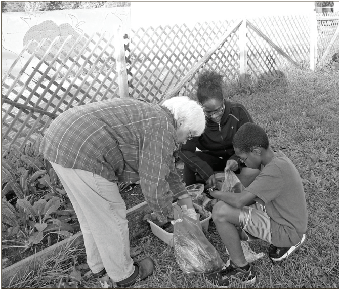
It's time to harvest and distribute some vegetables.

Another bountiful growing season is coming to a close at the Rosedale Grandmont Community Garden at Bushnell Church. Throughout the season, around 30 volunteers planted, watered, weeded, staked and harvested vegetables and fruit.