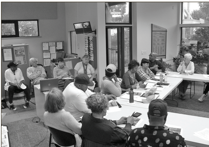
An overflow crowd participates at the Radio Patrol meeting at the GRDC office.