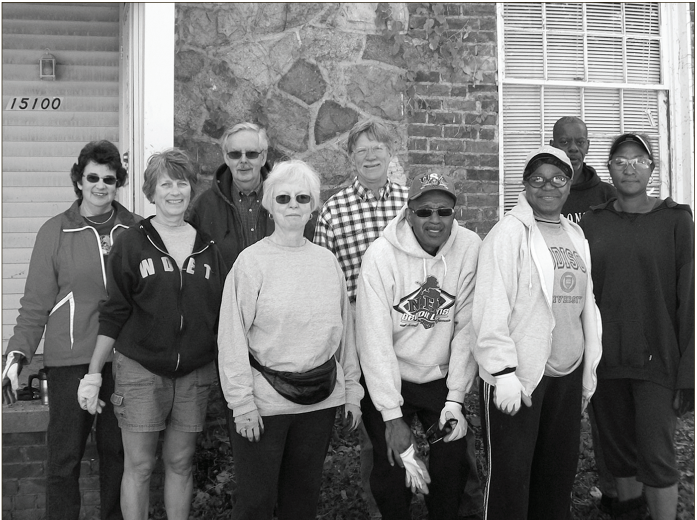
Neighbors pitching in to clean up a blighted yard of an abandoned home on Penrod.