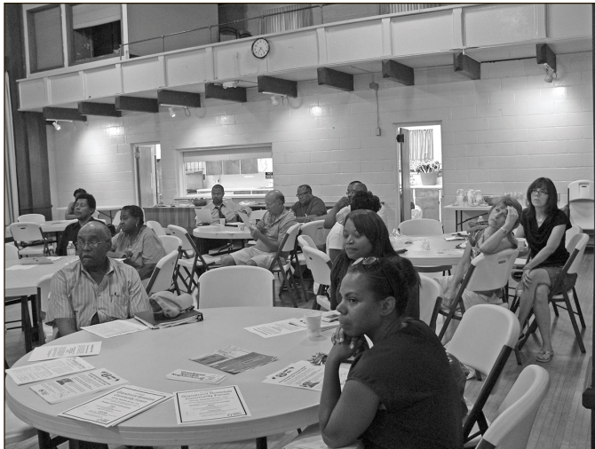
Rosedale Park residents listen to one of the speakers.