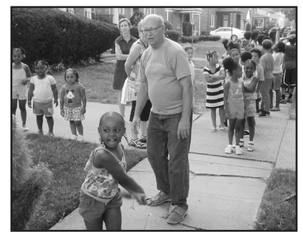
FAUST | Chalfonte to Eaton