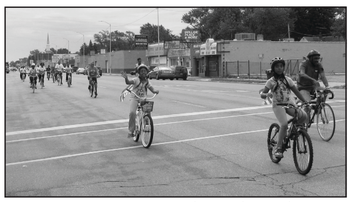
Bikers cruise down Grand River in 2015

Activities include bounce houses, food, a talent contest, train rides, and blood pressure screenings. For more information, contact Carolyn Akpe , 313-493-0824.