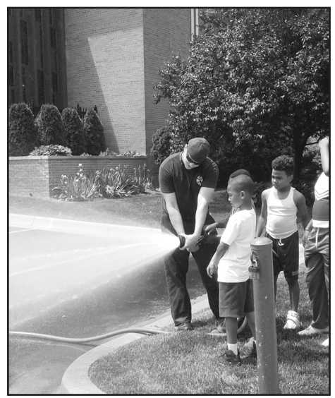
The Detroit Fire Department provided the kids at the June Day picnic a chance to hold a working fire hose.

• Sunday, August 21 RP Block Captains' Meeting - 4pm GRDC Office 19800 Grand River