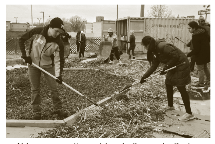
Volunteers spreading mulch at the Community Garden.