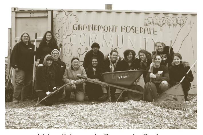
A job well done at the Community Garden.