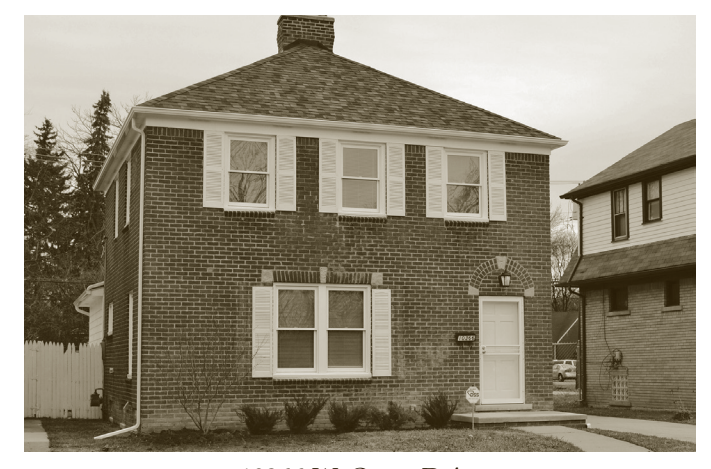
10366 W. Outer Drive

Thank you, GRDC, for helping our neighborhood!