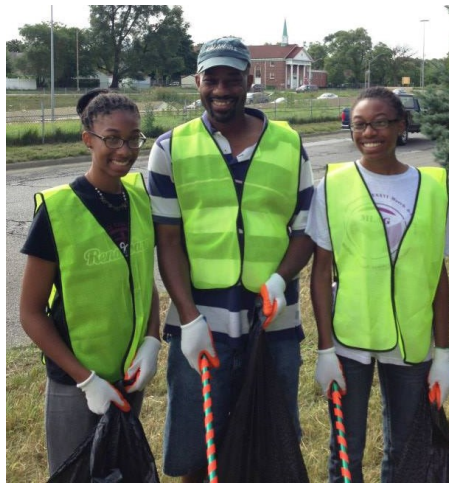
Trash Talkin' Volunteers

begin at the coffee shop because this is where the coffee and community piece of this project begins. The coffee is free and the community is guaranteed. After a morning coffee, volunteers can grab some gloves, litter grabbers