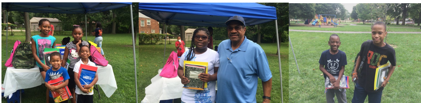
"Back to School" Celebration

Parents/Adult volunteers are still needed!!!