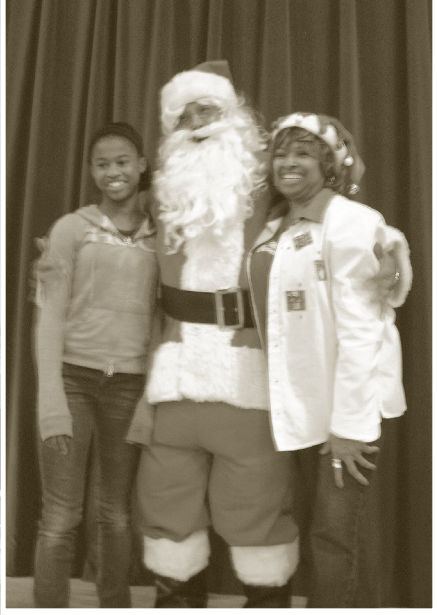
Santa with some helpers.