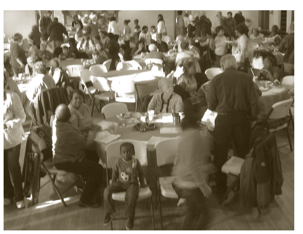
Neighbors enjoy breakfast and conversation.